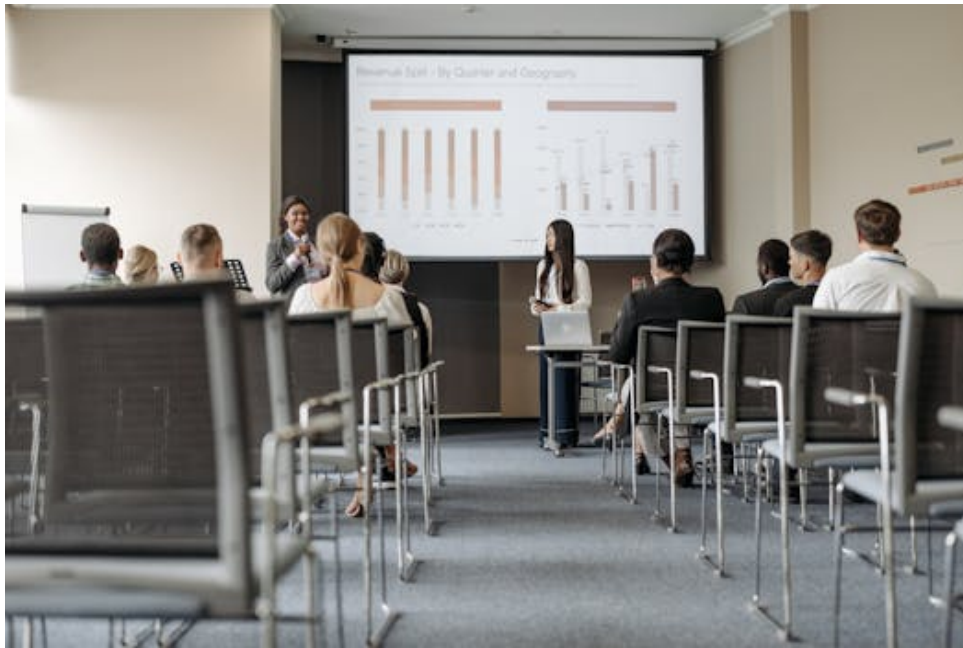
Figure 1: Great Pasta employees during a training seminar.

The data presented in this document highlights the commitment of Great Pasta to develop its workforce continually. With significant investments in training and a robust performance evaluation system, the company not only maintains high standards in the production of its products but also fosters a positive work environment for its employees.